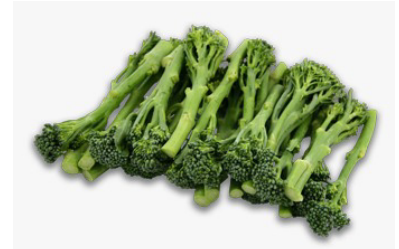
Tender Stem Broccoli