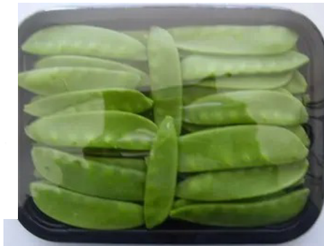
Extra fine beans